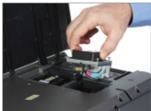
Top-accessed color wheels.