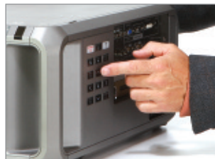
Complete local control.