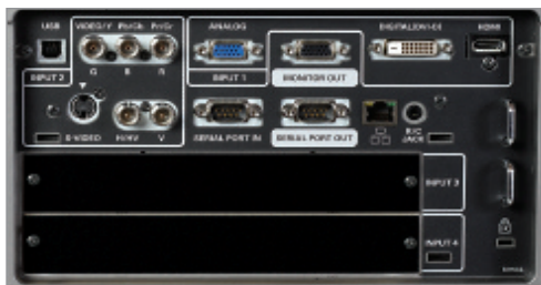
Professional inputs with 2 expansion bays.

Lamp interval timer permits alternate 1-lamp-ON in 24/7 use. Extended use: Peltier device cooled DMD®, sealed optical engine. Picture-in-Picture. Picture-by-Picture. Edge blending.