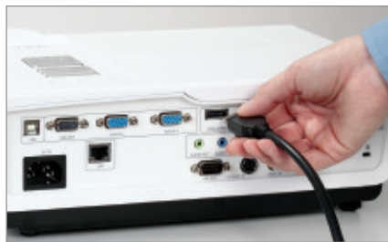
Connect and project.