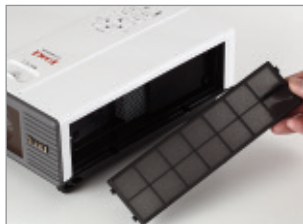
Handy access to air filter.