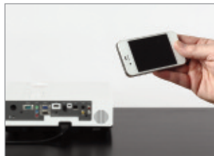
Wireless access with mobile terminal.