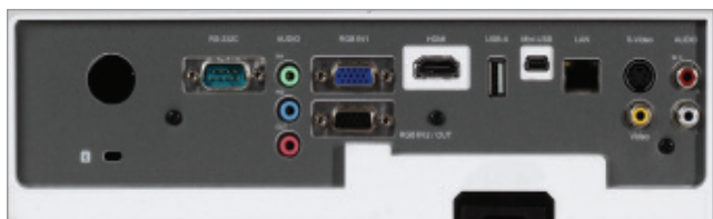
Includes a full complement of connections, including network control.

EIKI® is a registered trademark of Eiki International, Inc. Kensington® is a registered trademark of ACCO Brands Corporation.