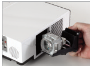
Easy to change long-life lamp.