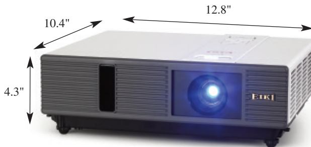
LC-WNB3000N, LC-XNB3500N, LC-XNB4000N • XGA projector.