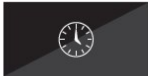
Track projector light source usage