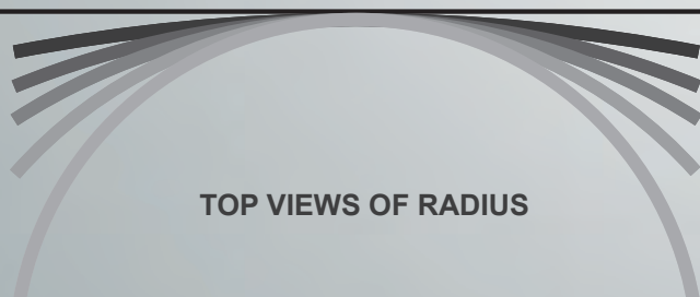
TOP VIEWS OF RADIUS

The ProMask-curve is available in a custom radius ranging from as extreme as a 7' radius curve to a mild 80' radius curve. Please inquire with SmX to determine what curve will work best for your application.